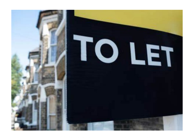
Very energy efficient - lower running costs