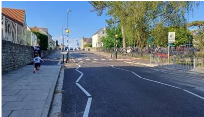
Figure 1. Albert Road Zebra Crossing