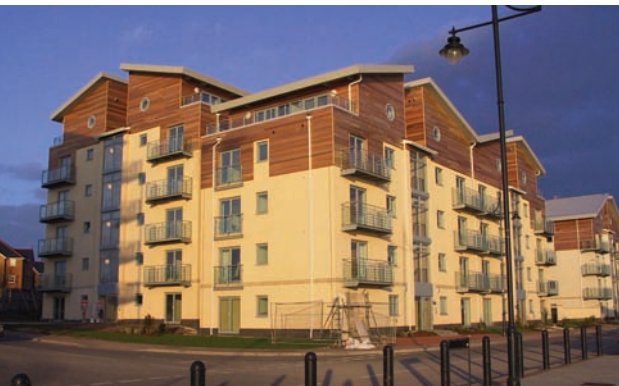
Left: New residential development by Westbury Homes overlooking no.1 Dock.